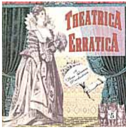
Art Erratica (“AEZ”)

I adore every single art zine I've been lucky enough to get my hands out, but these three stand out as my faves: