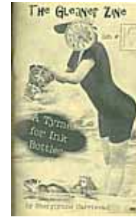
The Gleaner (email for details)

Fantastic articles!!! Consistently awesome art! Great zine!